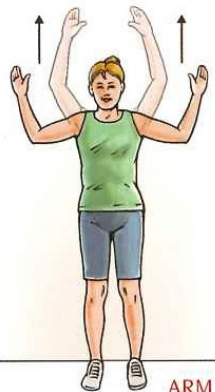
ARM SLIDE ON WALL

3. ARM SLIDE ON WALL: Sit or stand with your back against a wall and your elbows and wrists against the wall. Slowly slide your arms upward as high as you can while keeping your elbows and wrists against the wall. Do 3 sets of 10.