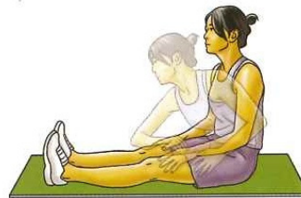
THORACIC SIDE STRETCH

7. THORACIC SIDE STRETCH: To stretch your right upper back, point your right elbow and shoulders forward while twisting your trunk to the left. Hold for a count of 15. Repeat 3 times. To stretch your left upper back, point your left elbow and shoulder forward while twisting your trunk to the right. Hold for a count of 10. Repeat 3 times.