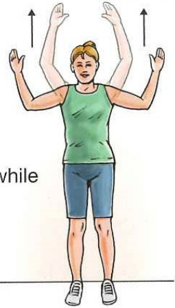
ARM SLIDE ON WALL

4. ARM SLIDE ON WALL: Sit or stand with your back against a wall and your elbows and wrists against the wall. Slowly slide your arms upward as high as you can while keeping your elbows and wrists against the wall. Do 3 sets of 10.