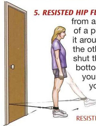
RESISTED HIP FLEXION

5. RESISTED HIP FLEXION: Stand facing away from a door. Tie a loop in one end of a piece of elastic tubing and put it around one ankle. Tie a knot in the other end of the tubing and shut the knot in the door near the bottom. Tighten up the front of your thigh muscle and bring your leg forward, keeping your knee straight. Do 3 sets of 10.