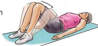
HIP ADDUCTOR STRETCH

1. HIP ADDUCTOR STRETCH: Lie on your back, bend your knees, and put your feet flat on the floor. Gently spread your knees apart, stretching the muscles on the inside of your thigh. Hold this for 15 to 30 seconds. Repeat 3 times.