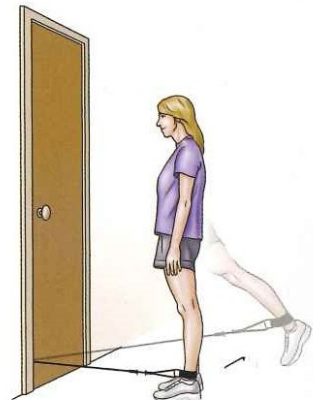
RESISTED HIP EXTENSION

6. RESISTED HIP EXTENSION: Stand facing a door with elastic tubing tied around one ankle. Knot the other end of the tubing and shut the knot in the door. Pull your leg straight back, keeping your knee straight. Make sure you do not lean forward. Do 3 sets of 10.