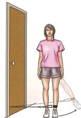
RESISTED HIP ABDUCTION

7. RESISTED HIP ABDUCTION: Stand sideways near a doorway. Tie elastic tubing around the ankle on your leg which is away from the door. Knot the other end of the tubing and close the knot in the door. Extend your leg out to the side, keeping your knee straight. Return to the starting position. Do 3 sets of 10.