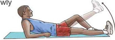
STRAIGHT LEG RAISE

4. STRAIGHT LEG RAISE: Lie on your back with your legs straight out in front of you. Bend one knee and place the foot flat on the floor. Tighten up the top of your thigh muscle on the opposite leg and lift that leg about 8 inches off the floor, keeping the thigh muscle tight throughout. Slowly lower your leg back down to the floor. Do 3 sets of 10 on each side.