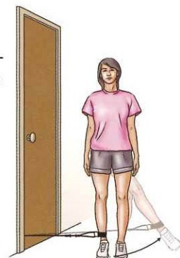
RESISTED HIP ADDUCTION

8. RESISTED HIP ADDUCTION: Stand sideways next to a door. Tie a loop in one end of the tubing and slip the loop around the ankle of your leg which is closest to the door. Make a knot in the other end of the tubing and close the knot in a door. Bring your leg with the tubing across your body sideways, crossing over your other leg and stretching the tubing. Return to the starting position. Do 3 sets of 10.