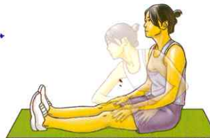
THORACIC SIDE STRETCH

7. THORACIC SIDE STRETCH: To stretch your right upper back, point your right elbow and shoulders forward while twisting your trunk to the left. Hold for a count of 15. Repeat 3 times. To stretch your left upper back, point your left elbow and shoulder forward while twisting your trunk to the right. Hold for a count of 10. Repeat 3 times.