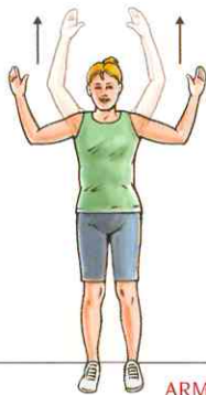
ARM SLIDE ON WALL

3. ARM SLIDE ON WALL: Sit or stand with your back against a wall and your elbows and wrists against the wall. Slowly slide your arms upward as high as you can while keeping your elbows and wrists against the wall. Do 3 sets of 10.